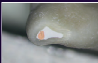
Cross-section 1 mm from the apex