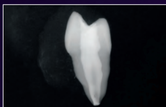
Radiograph showing the bucco-lingual aspect of the maxillary first premolar