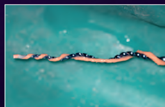
Root filling material removal during retreatment case