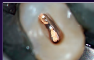
Photograph illustrating a case of retreatment before instrumentation